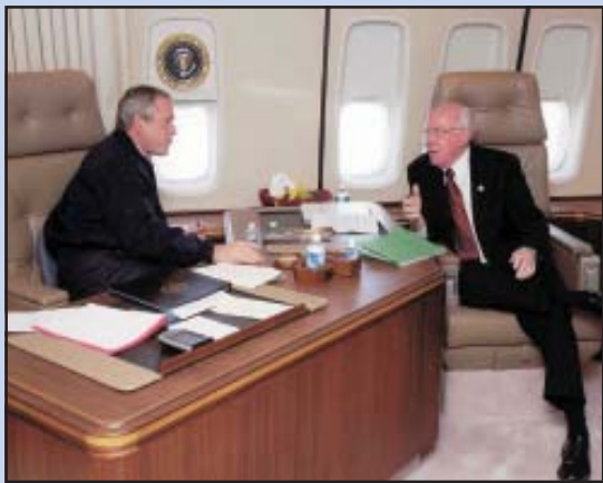
Congressman Ehlert discussed STEM Education and competitiveness issues with President Bush aboard Air Force One.

Finally, we are continuing to grow a bipartisan Congressional member organization called the House Science, Technology, Engineering and Math (STEM) Education Caucus. In just a year and a half, the Caucus has grown to include more than 100 Members of the House and includes a Senate Caucus as well. These Members of Congress are conscientiously seeking ways to improve STEM education by connecting educators, industry and policy-makers. For more information about the Caucus and its goals, please visit my website.